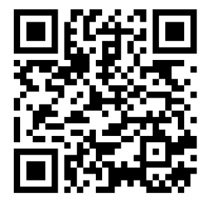
Review us on Google