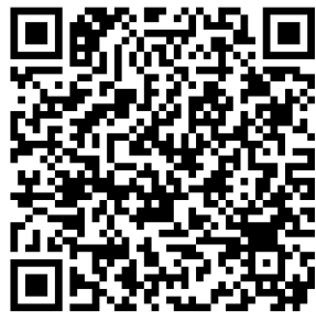
Review us on TripAdvisor

Scan the QR below to leave a review or search for 'The Nolly Café' on Google or TripAdvisor.